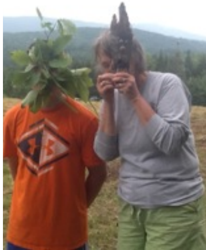
BOYD FAMILY FARM "Masked Peeps"