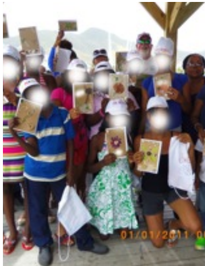
FOSTER CHILDREN IN ST. MARTIN

The results of these fund raising efforts along with the the paying participants allow us to offer so many scholarships.