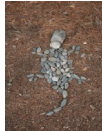
ROCK ART INSTALLATIONS "Magical Lizard"